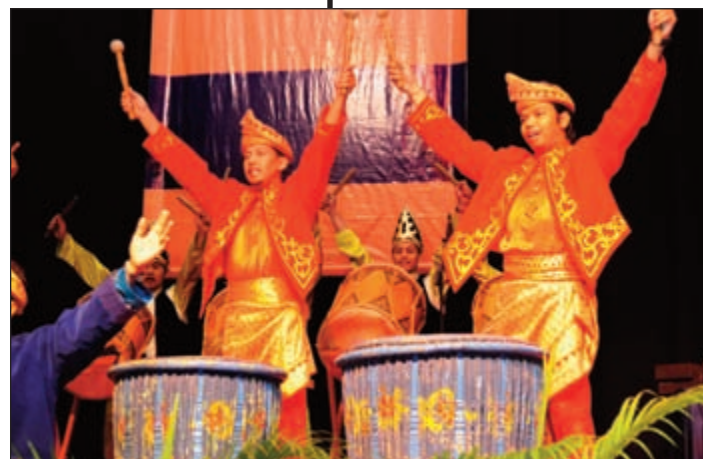
At the Opening Ceremony for the 13th ICID, Congress attendees were treated to a performance by the Malaysian Drum Symphony.