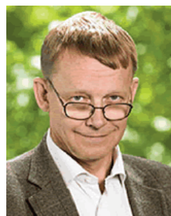
Dr. Hans Rosling • SWEDEN Dynamic Trends in Global Health