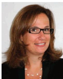
Dr. Ilaria Capua • ITALY Avian Influenza—A Unique Opportunity for Public Health